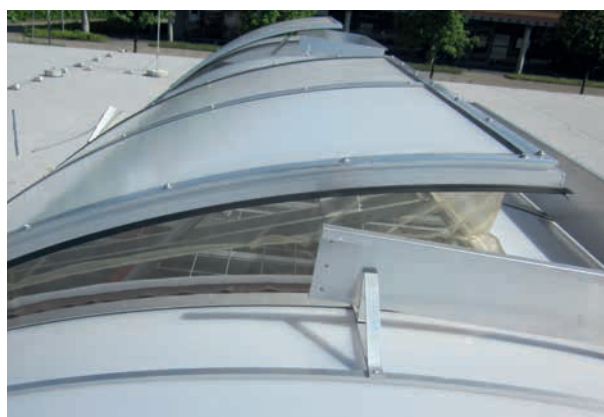
Continuous rooflight flap in ventilation position with insect screen system