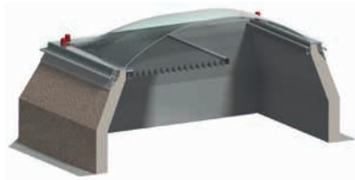
Sectional view of a fixed dome rooflight with solar shadowing