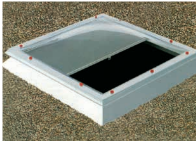
Opaque, roll-up curtains made of glass fibre cloth

Colour: light grey, coated on the reverse with aluminium-pigmented polyvinyl acetate