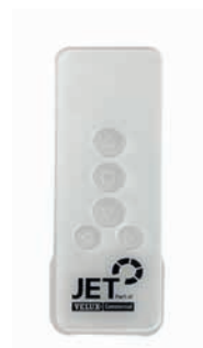
Five-channel hand-held remote control